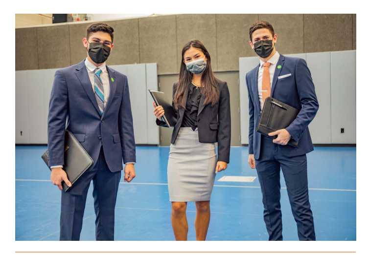
Undergraduate students smile for a picture before they begin networking with employers.